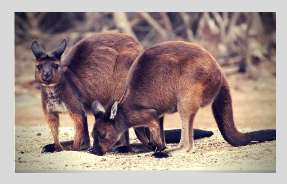
kangaroo island kangaroo