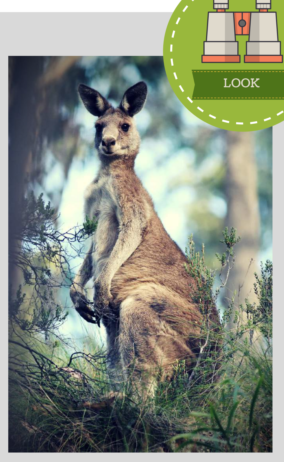
eastern grey kangaroo